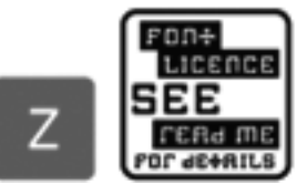
z REFERS TO "READ ME" FILE SENT OUT WITH FONT EXPLAINING THE LICENCE