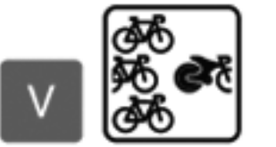
v UNFAIR TECHNOLOGICAL ADVANTAGE