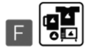
F CRAP IDENTITY BY COMMERCIAL DESIGN GROUP