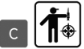
c STEROID INJECTING ASSEMBLY POINT