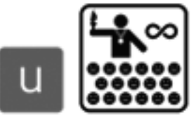
u OPENING CEREMONY LASTS FOREVER