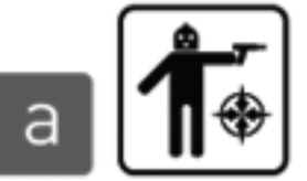
a TERRORIST ASSEMBLY POINT