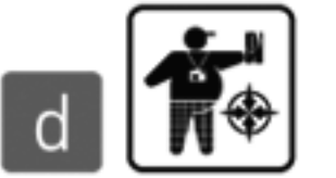
d AMERICAN TOURIST ASSEMBLY POINT