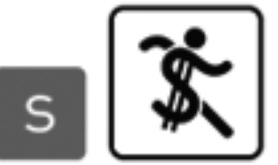
s TAKE THE MONEY AND RUN