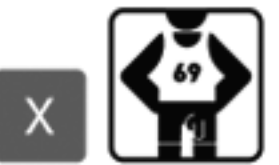
x REVEALING SPORTS WEAR