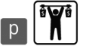
p FOCUS IS ON MONEY RATHER THAN SPORT