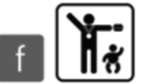
f SPORT PERSONALITIES UNDULY INFLUENCING CHILDREN