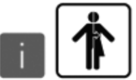
i FEMALE ATHLETE THAT USED TO BE A MAN