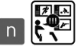
n SPORT ON EVERY BLOODY CHANNEL