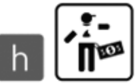
h EXTORTIONATELY PRICED MERCHANDISE