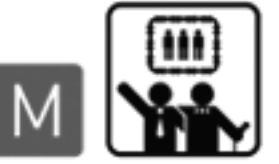
M ABUSE OF HUMAN RIGHTS IGNORED BY HOST COUNTRY