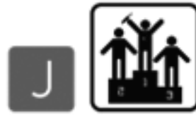
J CHINESE BLATANT STEROID CONSUMPTION