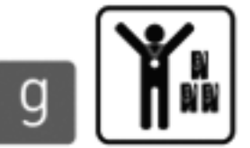
g SPORT PERSONALITIES USED TO ENDORSE UNHEALTHY PRODUCTS