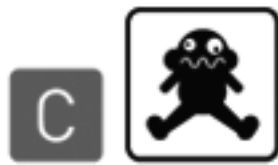
C CRAP OLYMPIC MASCOT