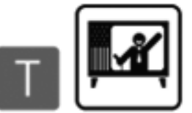
T AMERICAN BIASED TV COVERAGE