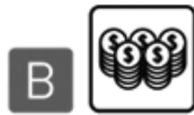
B HOST NATION BRIBES