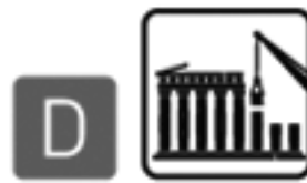
D STADIUM NOT QUITE FINISHED ON TIME