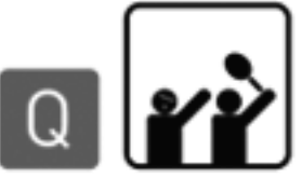
Q UNETHICAL POLITICAL IDEOLOGIES IGNORED