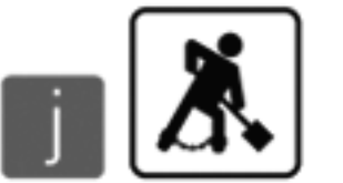
j STADIUM BUILT WITH THE USE OF SLAVE LABOUR