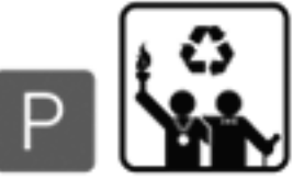
P ALL OPENING CEREMONIES LOOK THE SAME