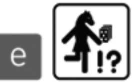
e OBSCURE CRAP SPORTS