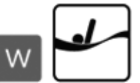
w DROWNING IN ADVERTISING