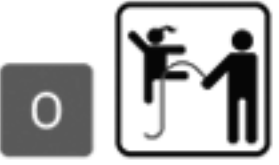
o OVER ZEALOUS TRAINER