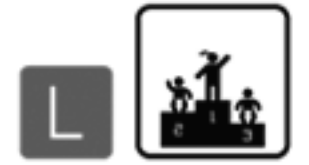
L PUBERTY DELAYED GYMNAST