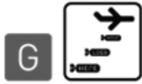
G CARPET BOMBING ADVERTISING