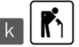
k OLYMPIC COMMITTEE MEMBER