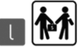
l 'GIFT' FOR OLYMPIC COMMITTEE MEMBER