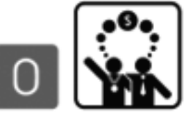
O OPPORTUNISTIC MANAGERS AND PUBLICISTS