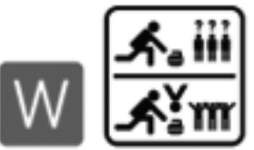
W OBSCURE SPORT THAT IS IGNORED UNTIL YOUR COUNTRY WINS A MEDAL