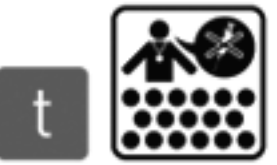
t DENIAL OF TAKING DRUGS AT PRESS CONFERENCE