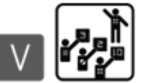
V BIASED JUDGE