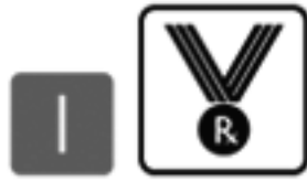
I MEDAL WON THROUGH THE USE OF PHARMACEUTICALS