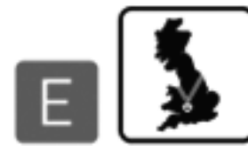
E BRITAIN IS RUBBISH AT SPORT