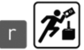
r POLITICS THROUGH SPORT