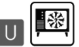
U ZERO VIEWER SPORT