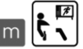
m UNHEALTHY ARMCHAIR SPORTS PERSON