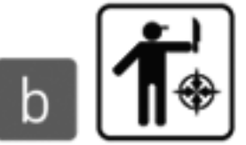
b OBSESSED FAN ASSEMBLY POINT