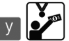
y PROFESSIONAL MILLIONAIRE SPORTS PERSON TRYING TO WIN GOLD