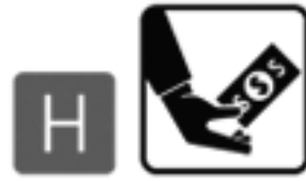
H BRIBABLE JUDGE