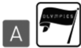
A THE OLYMPICS IS PRIMARILY ABOUT MAKING MONEY