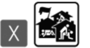
X LOADS OF SHAGGING IN THE OLYMPIC VILLAGE (PROBABLY)