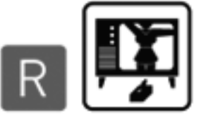
R WATCHING OLYMPICS PURELY FOR SEXUAL PURPOSES