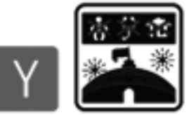
Y OLYMPIC BID IS MONEY NOT SPENT ON EDUCATION, HOSPITALS, HOUSING