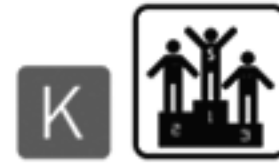
K RICHER COUNTRIES HAVE AN INCREASED CHANCE OF WINNING