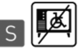
S ZERO COVERAGE OF DISABLED OLYMPICS