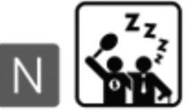
N BORING MILLIONAIRE TENNIS PLAYER